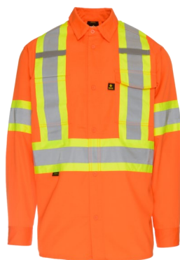
VHK142 Orange shirt with 4"bands