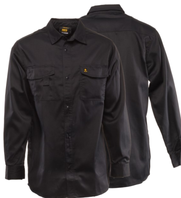
VHK321 Navy shirt