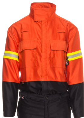
VHKA01 Aluskin Shirt