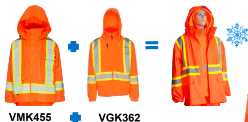
VMK455 + VGK362

The VGK362 jacket integrates with the VMK455 coat to make it a 3 in 1