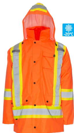
VMK775 5 in 1 jacket