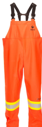
VHKF50 Rainsuit FR