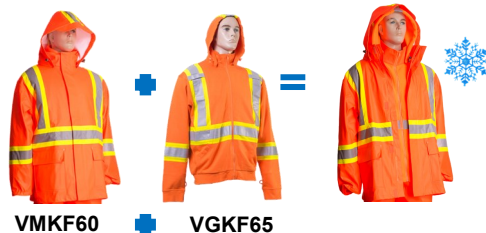
VMKF60 + VGKF65

Vest VGKF65 (ATPV 15 cal/cm2 - Cat. 2) integrates with coat to make a 3-in-1