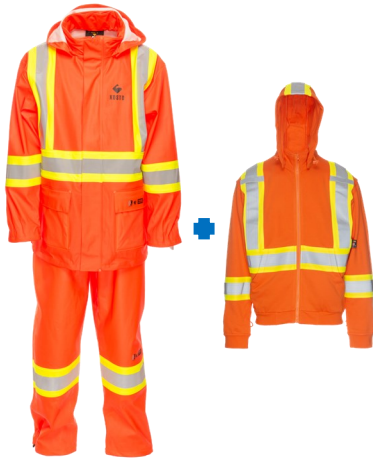
VMKF60 + VGKF65

VMKF60 et VGKF65 Rancoat et vest Arc flash (Cat. 2) ATPV 24 cal/cm 2